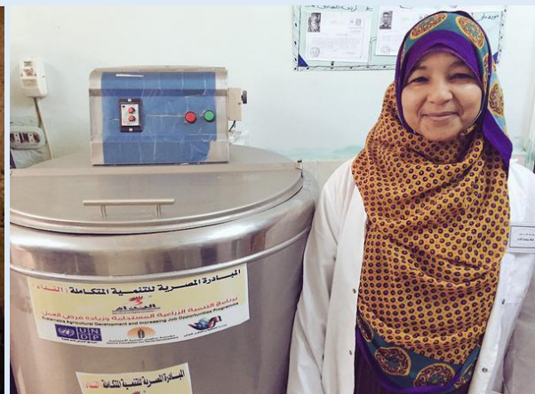
A women beneficiaries of the poultry raising units (left); A women beneficiaries from the bid milk processing units (right).