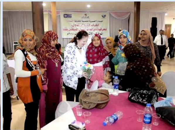
A women beneficiaries working in the Woodturning Workshop in El Gamaleia village (left); The ‘First Meeting for Craftswomen & Women Entrepreneurs’ held in Qena City in May (right).