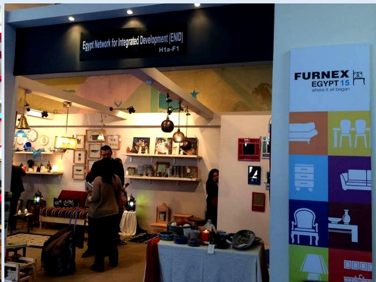
Renovated ENID Showroom in Dokki (left); ENID exhibition at FURNEX (right)